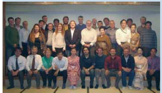
Fig. 2 – Task 10 and Task 11 Joint Meeting; Fukuoka, Japan.

In line with the objectives, the short term goal (5 years post) of the Task is to have a clear definition of the global market and all associated values; resulting in stakeholders considering urban scale PV in their respective spheres of activities. The Task's long term goal (10 years post) is for urban-scale PV to be a desirable and commonplace feature of the urban environment in IEA PVPS member countries.